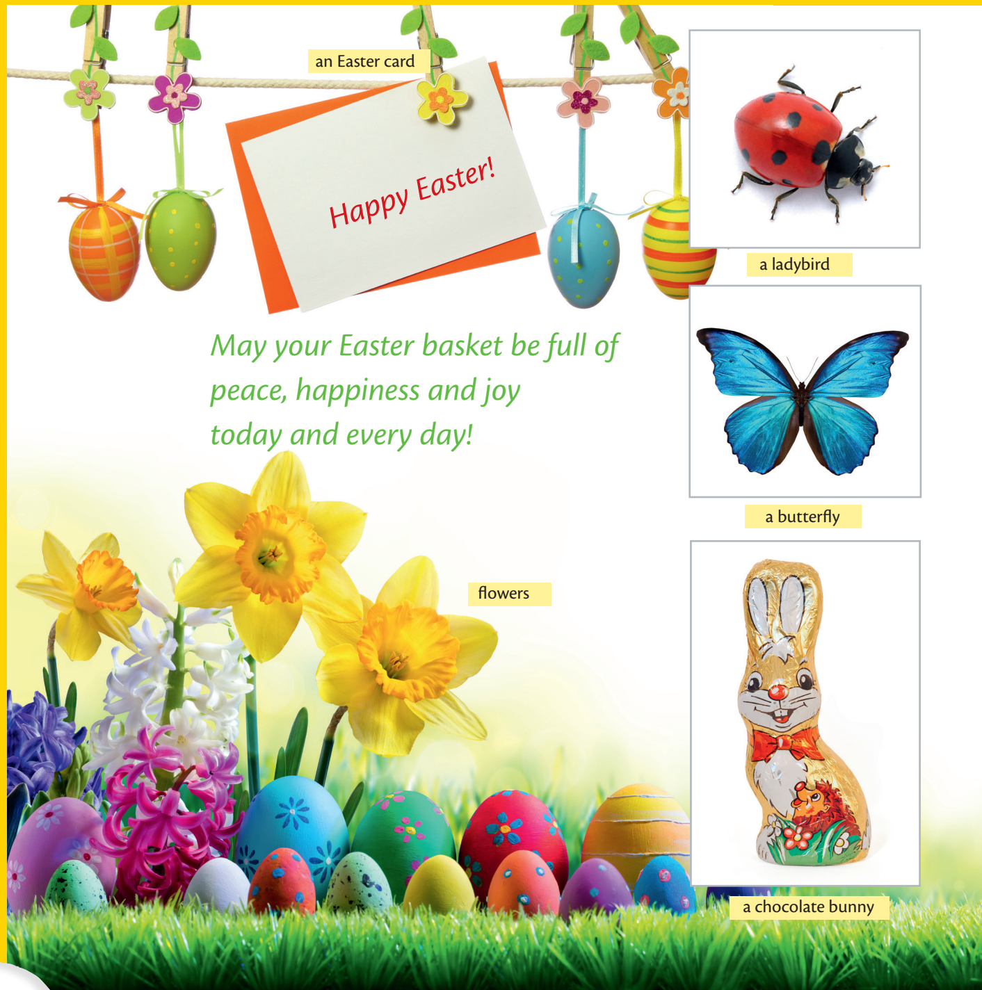
an Easter card